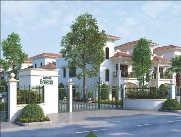
Centrally Located Club House