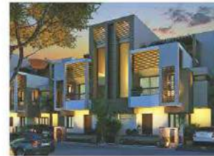
Astha Villa Vastral