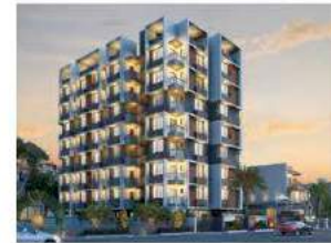
DM Pride Ishanpur