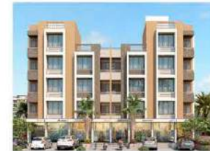
Astha Upvan Singarva