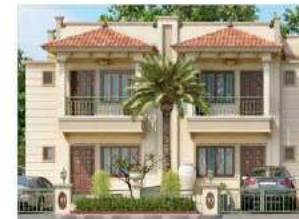
Astha Dreams Barejadi