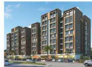
Astha Skyz Mahemdabad