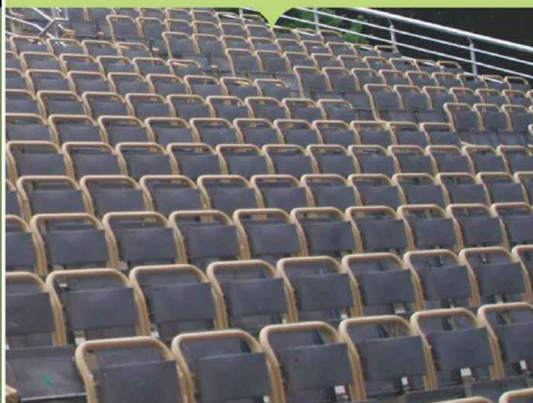
1 Km From Railway Station