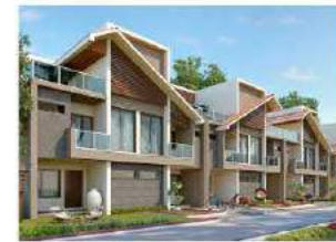
Astha Luxuria Vastral