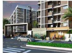
Astha Vihar Barejadi